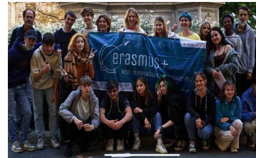
Group Activity FWS Innsbruck

In March 2021, the Rudolf Steiner Schulverein's application for accreditation as a consortium in the new Erasmus + School Education Programme 2021-27 was approved. Students and staff of the participating mandate schools will thus have the opportunity to carry out various activities with the support of Erasmus+. Budget requests are made annually and more Austrian Waldorf schools can participate in the programme.