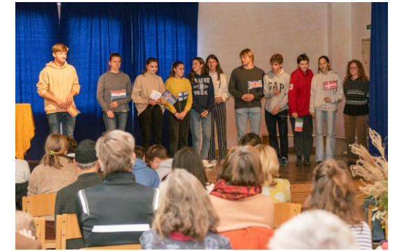
Präsentation at WS Karl-Schubert Graz

Teachers in training: Can come to the schools. (10-365Days)